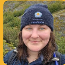
Regional Eldercare Advisor for Employment Services Southeast Regional Eldercare Coalition (SREC)